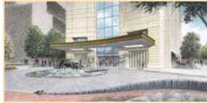
The Peninsula Tokyo - Forecourt

function rooms ranging from a main ballroom and extensive wedding suite to smaller meeting and banquet rooms; a swimming pool and spa including a Fitness Centre; retail; and a Peninsula Boutique.