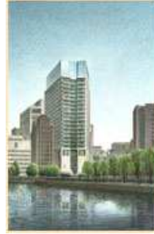
The Peninsula Tokyo - Building Exterior